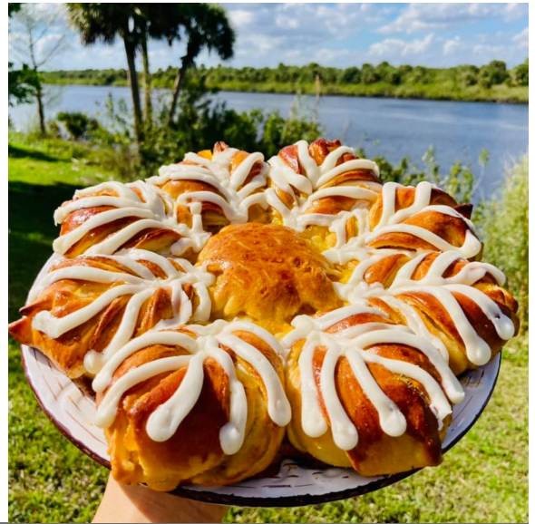
BLUEBERRY LEMON STAR TWIST SOLD BY CALOOSA KITCHEN AT THE SATURDAY MARKETS