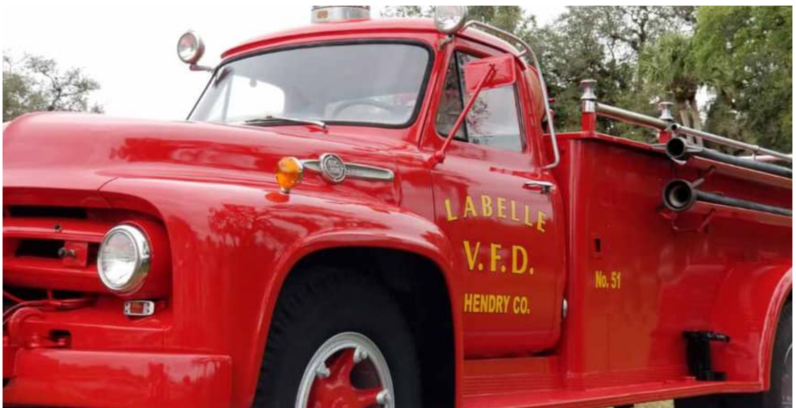
BELOW PHOTO: 'OLD BETSY' 1953 RESTORED LABELLE FIRE TRUCK